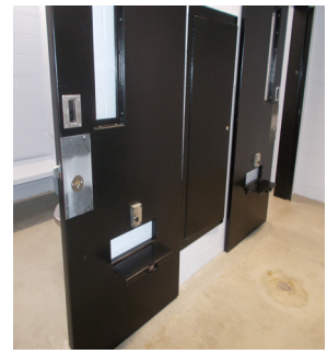
Public Safety Complex Cell Block Renovations, Willimantic, CT (42 officers; pop. 25,268)

A space needs analysis determined needs for cells, holding areas and interview rooms. Cell separation, ADA accessibility, monitoring equipment and decontamination areas were included in the renovations.