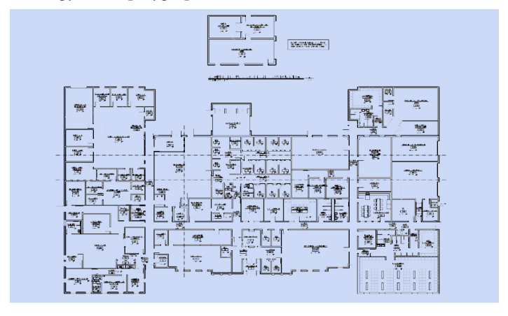
Police Department Renovations Cheshire, CT (55 officers; pop. 29,261)

with 20 officers. Plans shown below include additional office space, holding cells, conference space, locker facilities, role call room, gym and polygraph room.